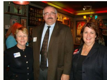
Judge Cagle, Judge Kennedy, and Judge Bradshaw-Hull,